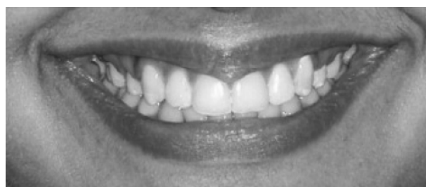
Figure 1 Photograph showing the rectangular area around the mouth.

The distribution related to non-parametric variables such as visible maxillary first molar, visible mandibular teeth, and visible maxillary gingival margin in the extraction and non-extraction groups are shown in Table 4 as judged by the principal examiner. No significant differences were observed between the groups. The mean aesthetic scores of subjects in the extraction and non-extraction groups as judged by laypersons showed no significant difference between the groups.