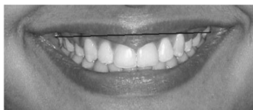
Visible dentition width