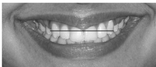
Maxillary intercanine width